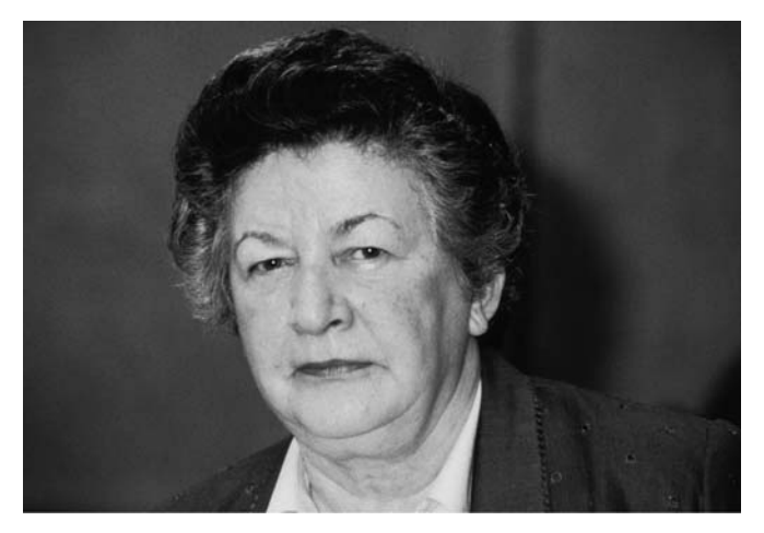
12. Yugoslav Prime Minister (1982-6) Milka Planinc

Another way in which the level of gender equality can be assessed is to consider it in the workforce. Here, two variables – income and the division of labour – will be examined. In terms of income, Communist states generally performed no better and no worse than their Western counterparts. By the late 1980s, for instance, women earned on average only 66–75% (depending on the country) of what men working in the same profession earned. This was in part because women tended to occupy lower positions in any given profession's hierarchy. The division of labour in Communist states was also rather similar to that in the West, in that women were heavily over-represented in some professions – notably the so-called caring professions such as healthcare and teaching – and under-represented in others. But even in the more feminized professions, the percentage of men increased markedly further up the hierarchy.