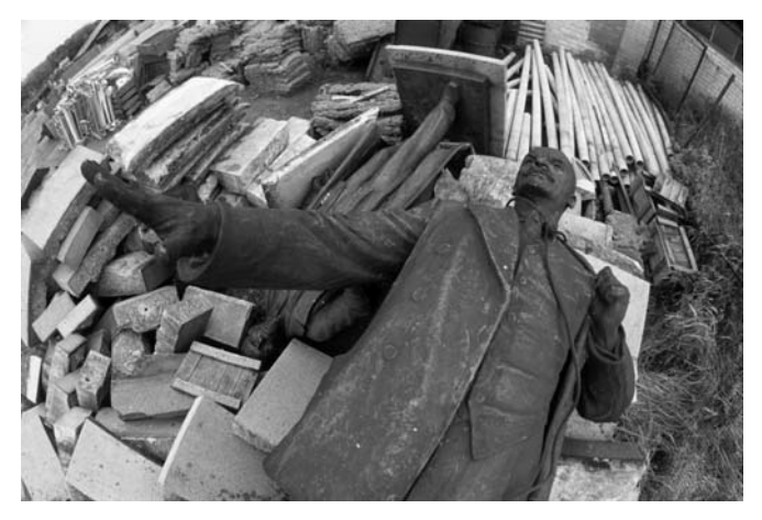
17. Toppled Lenin statue (Estonia)

of them to go as far as it did. But had it not been for Gorbachev's policies and overall approach, the eventual outcomes would not have occurred when and how they did.