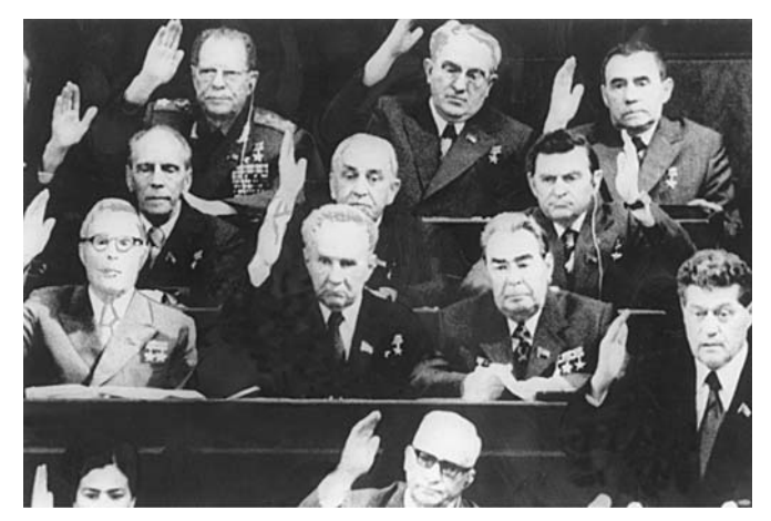
7. The Soviet Politburo (1977)

there was often overlap between party and state bodies; but party leaders' warnings against the dangers of substitution were all too often made half-heartedly or fell on deaf ears. After all, many party functionaries were keen to exercise as much power as possible.