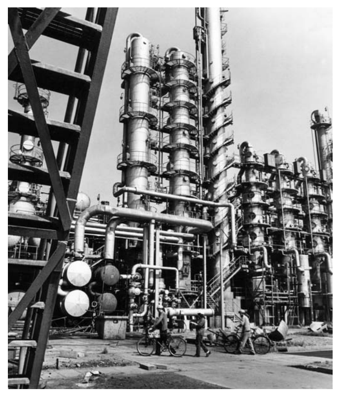
10. A large-scale chemical enterprise in East Germany

In theory, their control over the economy meant that Communists were particularly well placed to ensure that economic development was not at the expense of the environment. In practice, the commitment to economic growth at almost any cost typically meant the environment was a low priority, and most East European states had worse environmental problems by the 1980s