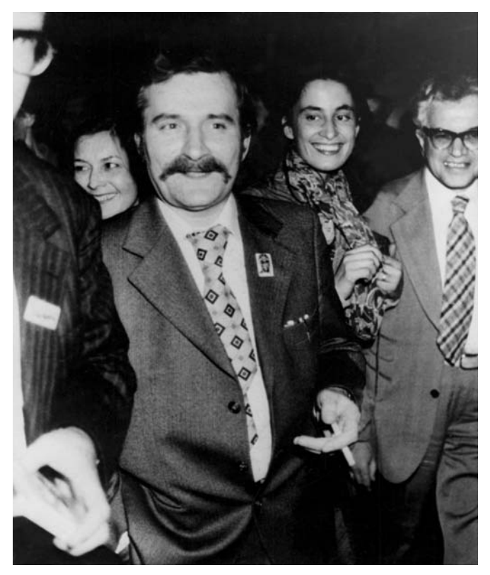
6. Lech Walesa, head of Poland's Solidarity (in 1980)

the first of what were to be many general strikes over the next fifteen months.