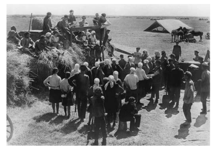
9. Early days of Soviet collectivization (1929)

difficult to buy eggs, chickens, rabbits, and other types of food; Poland and Yugoslavia took private ownership in the countryside even further, in that most farms in these two states were privately owned and operated.