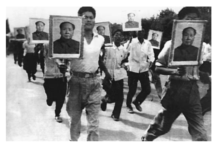
5. Red Guards support Mao during the Chinese Cultural Revolution

The Cultural Revolution wreaked havoc in China, and has been seen by post-Mao Chinese leaders as a serious mistake. At its height, people could be in trouble simply for listening to the 'wrong' type of music (e.g. European classical music, such as Beethoven) or reading 'bourgeois' literature. Like Soviet citizens in the 1930s, many ordinary Chinese citizens lived in fear of the authorities. But in some ways, the lot of those Chinese who survived was even worse than that of their Soviet counterparts. Educated Chinese could be accused of manifesting 'bourgeois' characteristics simply because of their better education levels - and if they were urban residents, there was a strong possibility that they would be forced to move to the countryside to work in the fields. According to the post-Mao Chinese authorities, almost 730,000 Chinese were directly persecuted during the GPCR, of whom almost 35,000 died as a direct result; some Western estimates suggest considerably higher numbers, with several million deaths. What is incontrovertible is that hundreds of millions of Chinese were seriously - negatively - affected in one way or another