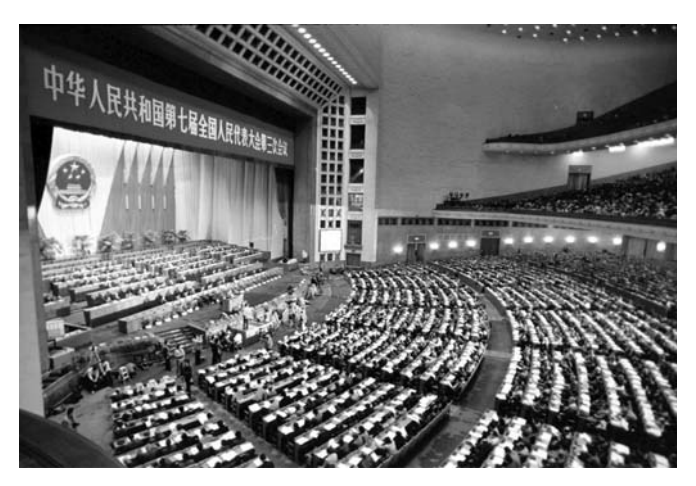
8. The Chinese National People's Congress

included Yugoslavia and Poland on occasions. Another exception that proves the rule is provided by the East German legislature. In its 40-year history, the People's Chamber only once experienced a less than unanimous vote; this was in 1972, when the East German Communists permitted members of the Christian Democratic Union a conscience vote on the proposed new abortion law. But this vote in no way threatened the Communists' position or represented open opposition; the whole process was tightly controlled.