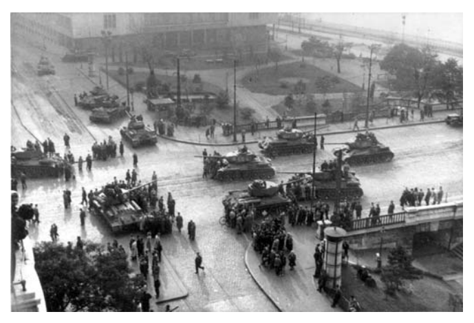
4. The Hungarian Uprising of 1956

gradually spread around the world, so the pent-up frustration and anger of large numbers of citizens in two countries in which the Soviets were seen to have imposed Communism, Poland and Hungary, burst into the open.