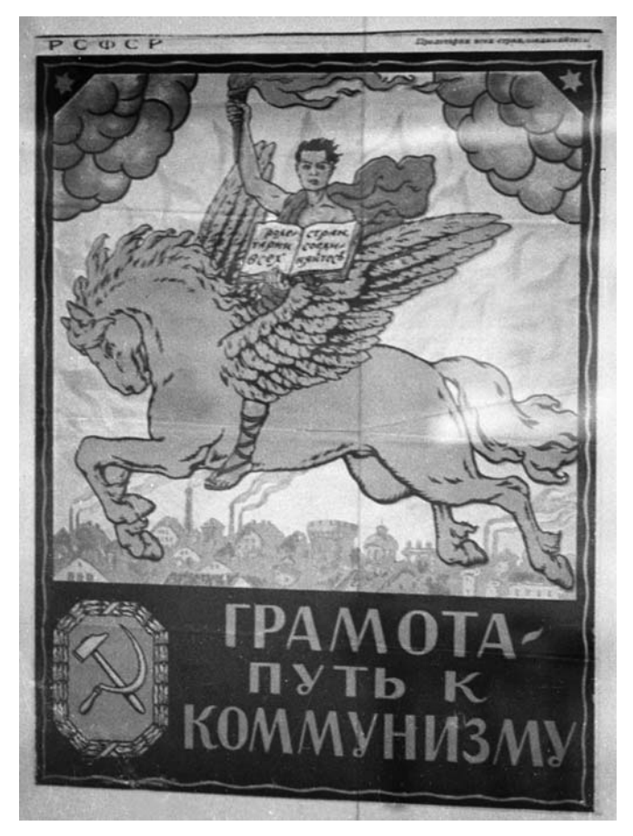
11. An early Soviet literacy poster (the caption reads 'Literacy – the Way to Communism')

explain why Russia, for example, did not have any structural unemployment benefits from 1930 until the beginning of the 1990s – they were considered unnecessary – and only opened its first unemployment office in decades in July 1991. It also helps to explain why people who have suffered unemployment and