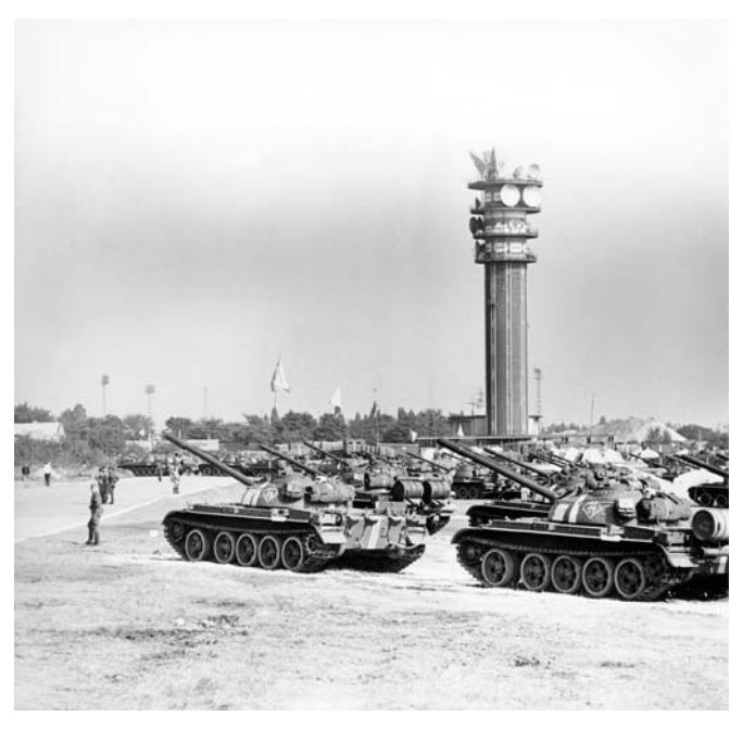
13. Warsaw Pact invasion of Czechoslovakia (1968)

been at least as keen as the Soviet leadership to suppress what they saw as a potentially contagious development in Czechoslovakia. After all, were the Prague Spring ideas to spread and be adopted, their own positions would be threatened.